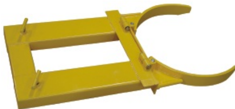
Drum Gripper (Fork Truck Attachment) VH-DGS-30