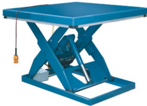
VT-200-AC AC Lift Table