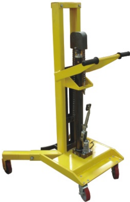
Drum Lifter VD-LD