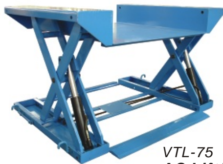
VTL-75 AC Lift Table