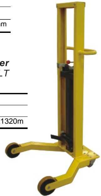
Drum Lifter VD-LT