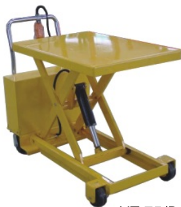
VT-75/DC DC Lift Table