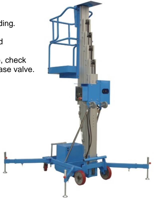
VH-PV-7 Aluminum Work Platform