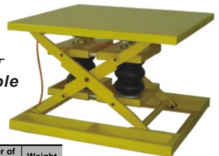
VP-200PT Pneumatic Lift Table

* Special sizes are available upon request